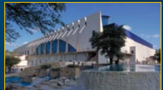
Henry B. Gonzalez Convention Center San Antonio, Texas