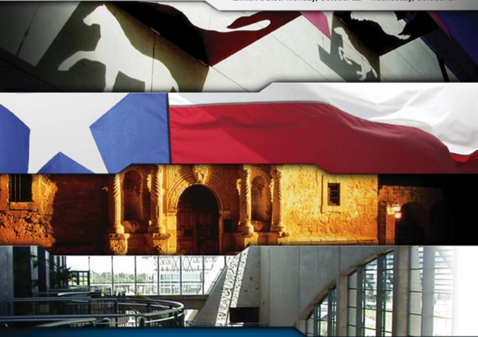
Exhibit Dates: Monday, October 22 – Wednesday, October 24

Secure Your Space Early for a Prime Spot!